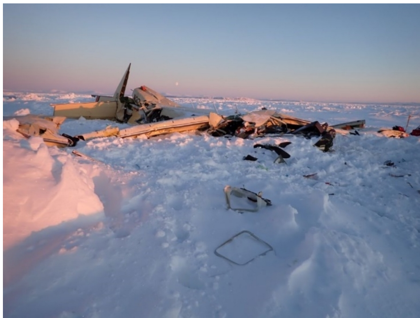
Figure 1. Accident site.

The airplane came to rest upright. The propeller assembly separated from the engine and was located adjacent to the wreckage. The engine cowling was dislocated and fragmented. The engine remained secured to the mount; however, both the engine assembly and the mount were damaged consistent with impact forces. The fuselage exhibited upward crushing damage along the entire length. Both wings were damaged, with the left wing being partially separated from the fuselage. Both wings exhibited leading-edge crushing damage along the entire spans. The outboard portion of the right wing was rotated aft and partially separated. An initial airframe examination revealed no evidence of an in-flight structural failure.